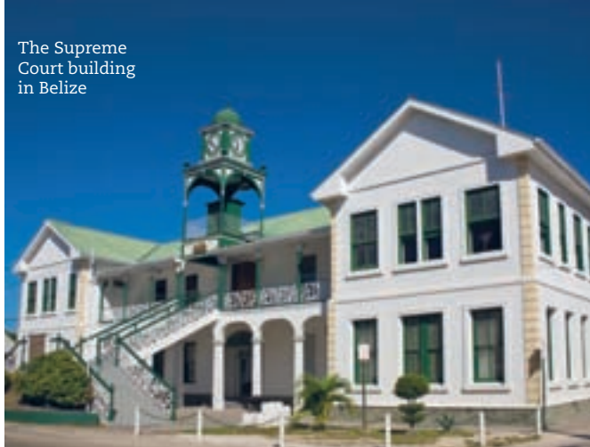
The Supreme Court building in Belize